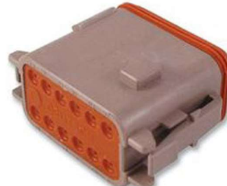
netSwitch - D (brown)

12=SW2-B 1=SW2-A 11=SW3-B 2=SW3-A 10=SW1-B 3=SW1-A 9=SW0-B 4=SW0-A 8=EXT3 5=EXT1 7=EXT2 6=EXT0