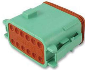
netSwitch - C (green)

12=SW7-B 1=SW7-A 11=SW6-B 2=SW6-A 10=SW5-B 3=SW5-A 9=SW4-B 4=SW4-A 8=ADC3 5=ADC1 7=ADC2 6=ADC0