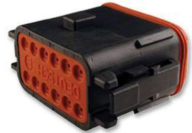
netSwitch - B (black)

12=--- 1=--- 11=Ground 2=Ground 10=--- 3=USB5V 9=5VOUT 4=5VOUT 8=SRX 5=STX 7=USB+ 6=USB-