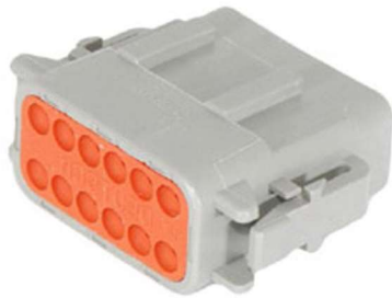
netSwitch - A (gray)

12=SW7-B 1=SW7-A 11=SW6-B 2=SW6-A 10=SW5-B 3=SW5-A 9=SW4-B 4=SW4-A 8=ADC3 5=ADC1 7=ADC2 6=ADC0